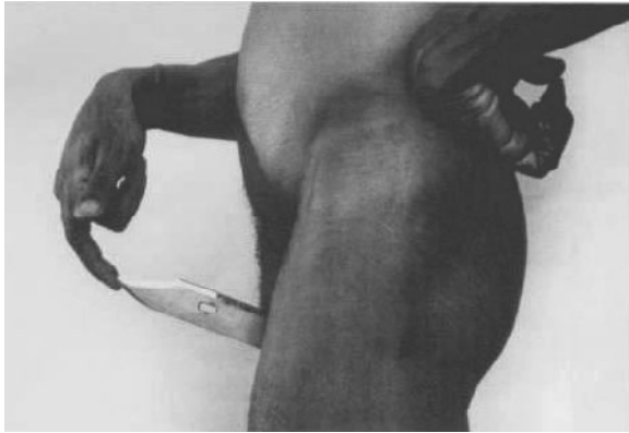
Fig. 2. René Peña, Serie Rituales (1994), Gelatin silver print.

a knife. In Queloides II he presented pieces from his series Man Made Materials (original title in English) in which he offers close ups of the black skin. By bringing the black skin close to spectators, Peña assaults fears of racial contagion – this is the knife again, in a different shape – and reasserts the humanity of the black body, no longer just the object of lust and erotic desire. 22